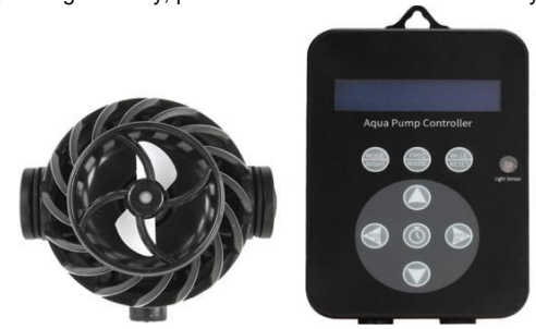
Models: QP-5 plus/QP-9 plus/QP-16 plus

Before assembling and operating correctly, please read the user manual carefully.